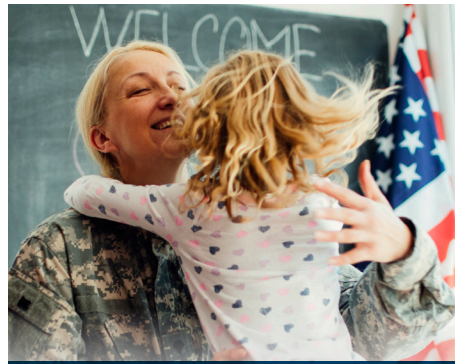
In 2017, the United Health Foundation released the America's Health Rankings Health of Women Who Have Served Report .

By working with Houston's Hope Farms in support of their Hope Farmer program, the United Health Foundation grant will train local veterans interested in owning farms to be urban farmers. The initiative will also devote 4.5-acres that can generate thousands of pounds of produce annually for families through on-site and citywide markets. Moreover, the initiative aims to empower families to make healthy choices through nutrition classes, meal prep and interaction with the veteran farmers.