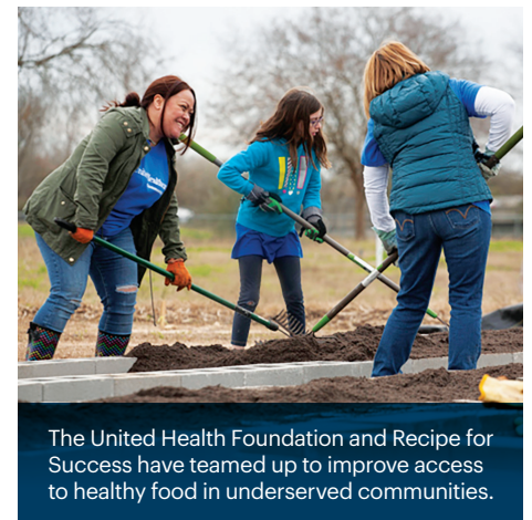
The United Health Foundation and Recipe for Success have teamed up to improve access to healthy food in underserved communities.

and universities in the United States founded for the higher education of Native students.