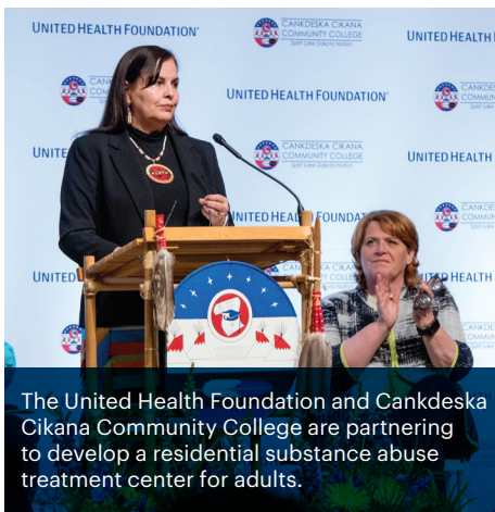
The United Health Foundation and Cankdeska Cikana Community College are partnering to develop a residential substance abuse treatment center for adults.

We partner with organizations committed to making health care better through innovation, local insight and perseverance in the face of tremendous challenges. Together, we're discovering new insights into the health of our communities and helping to create the path to a healthier future. These partnerships focus on the following four areas: Connecting Individuals to Quality Care; Creating a 21st Century Health Workforce; Supporting Whole-Person Health; and Serving Distinct Populations.